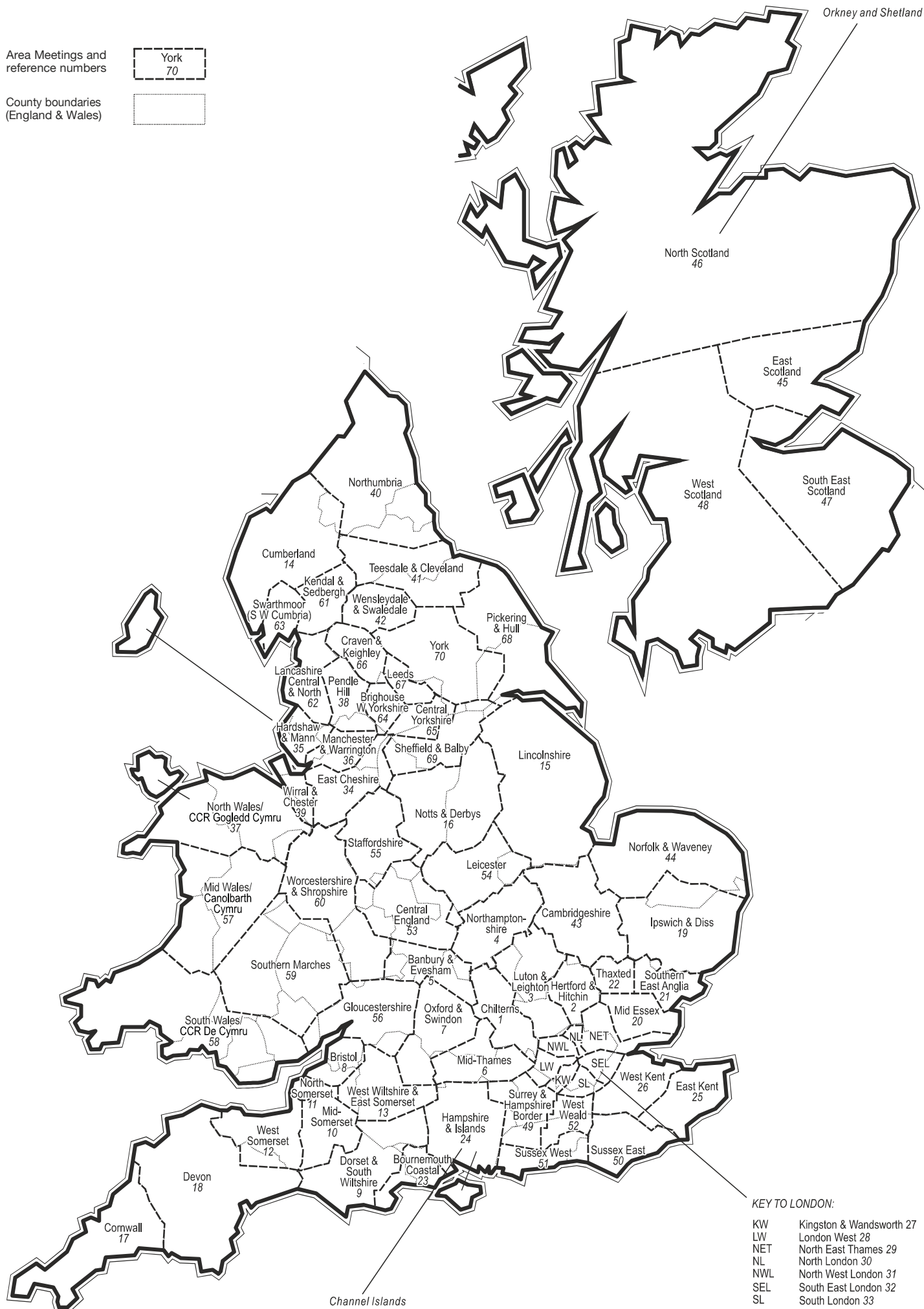
Figure 3. Area Meetings of Britain Yearly Meeting