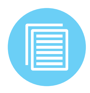
12 or 24 month fixed term contracts available