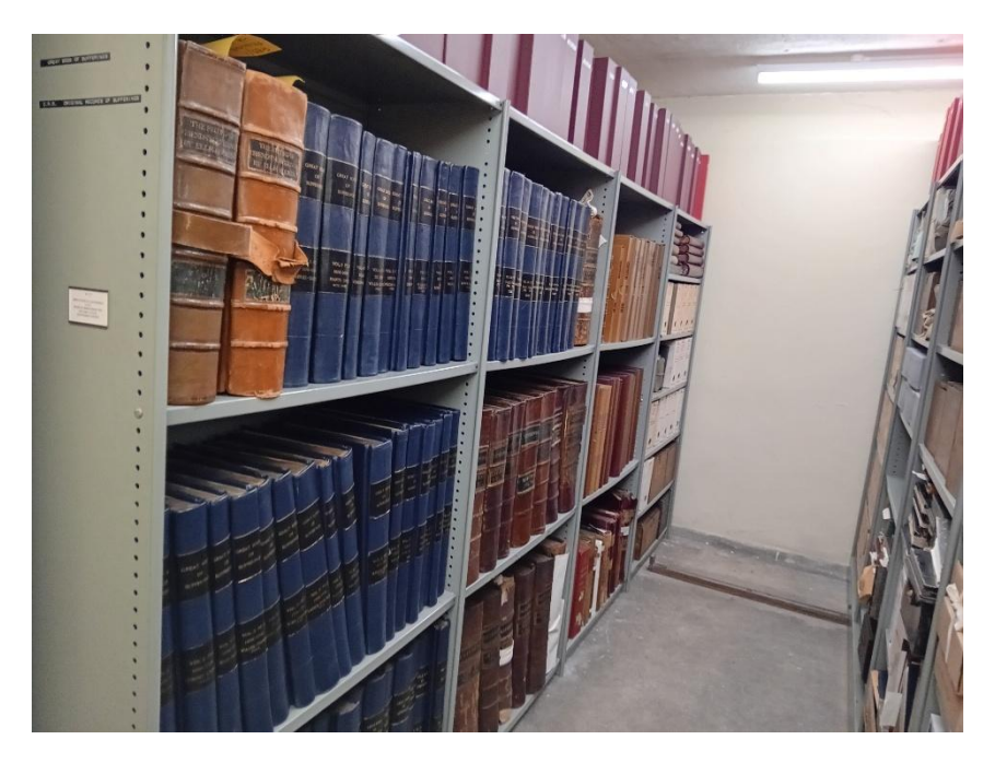
The Books of Sufferings in the library at Friends House, containing the names of Quakers imprisoned for their faith throughout our history.