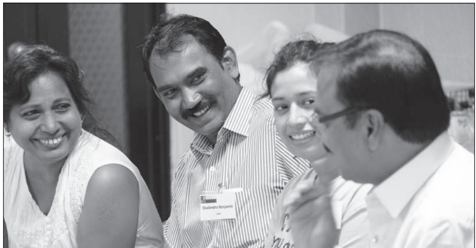
Friends at the AWPS Gathering in Hong Kong, 2018.

The number of stories on our website is growing. The stories are diverse and some are short and some are long but they all are stories of the heart. http: www.fwccawps.org/category/crossing-cultures-sharing-stories