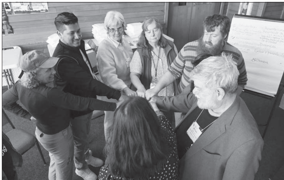
Friends at the 2019 Section of the Americas meeting in Missouri, USA.