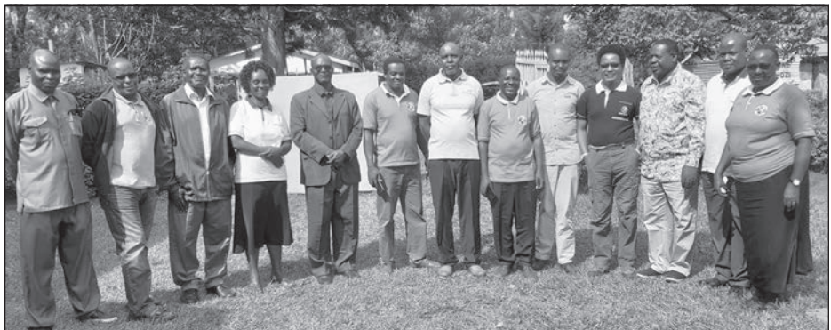
FWCC Africa Section Executive Committee, Lugulu, Kenya, June 2019.