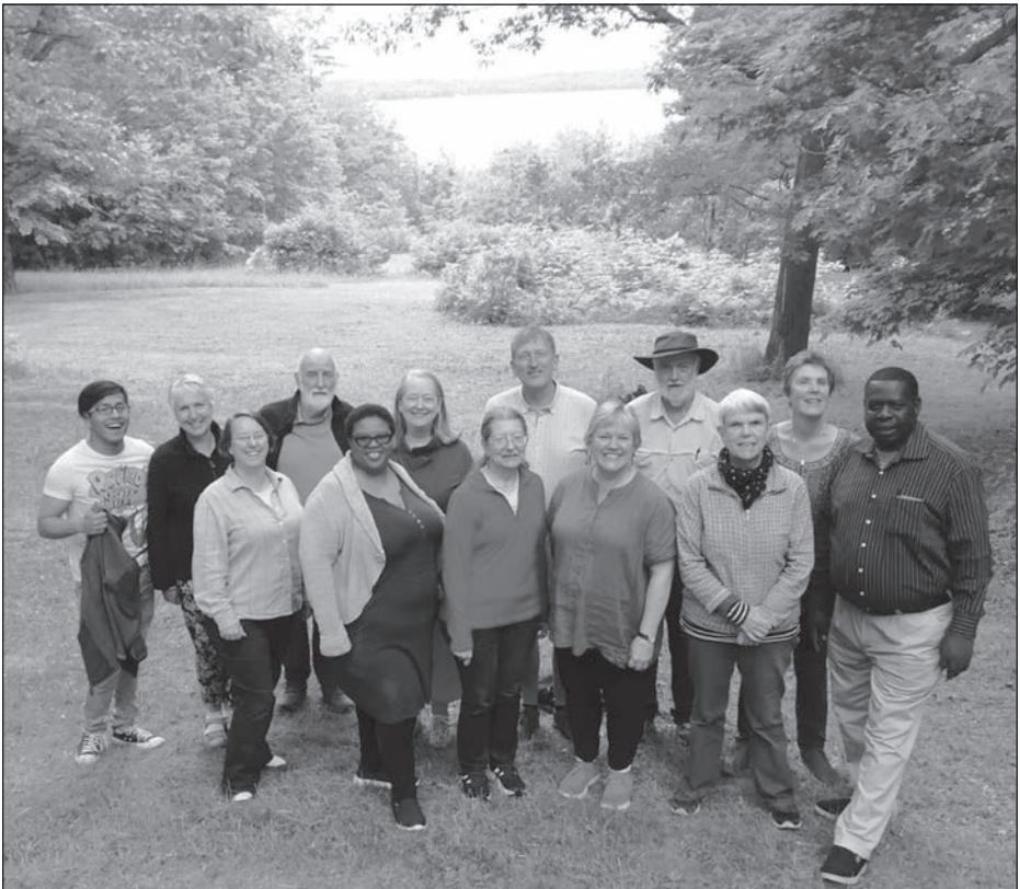
The FWCC Central Executive Committee at Camp NeeKauNis, Canada in June 2019.