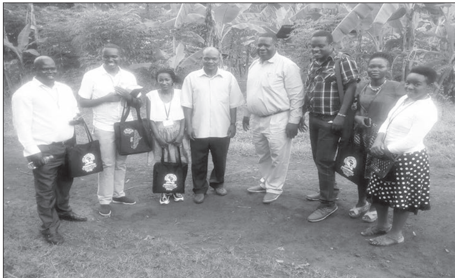
Participants on the YQCA leadership training programme in Iganga, Uganda, December 2018.