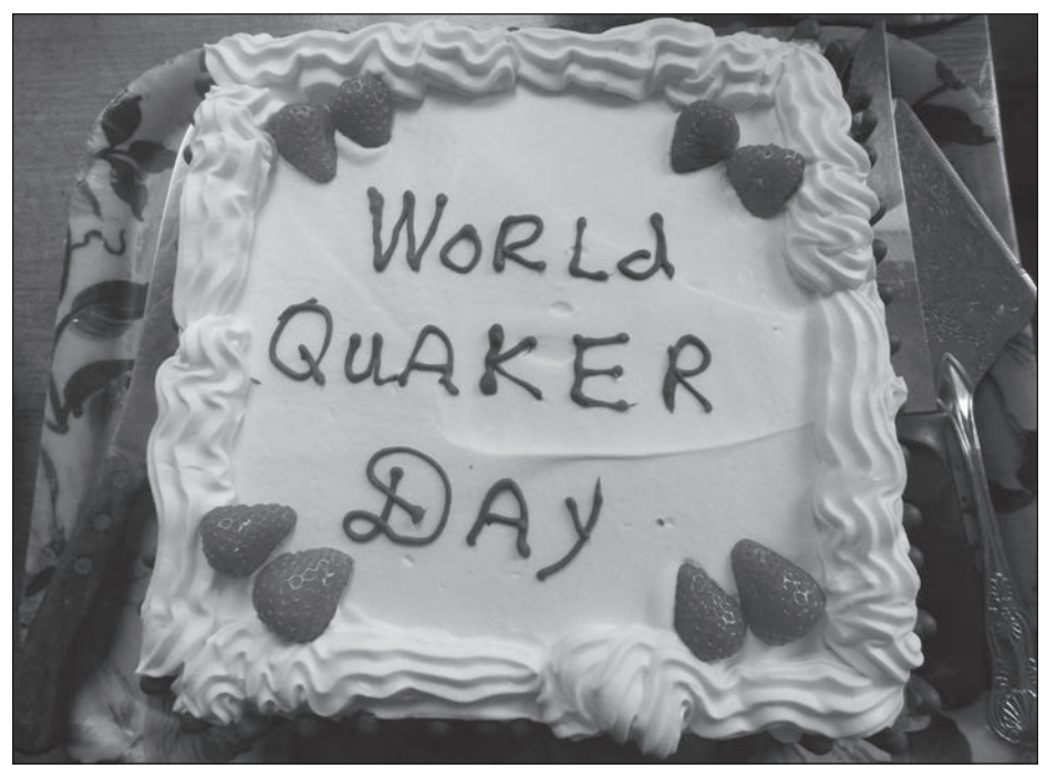
Friends in Dublin enjoyed a special World Quaker Day cake.