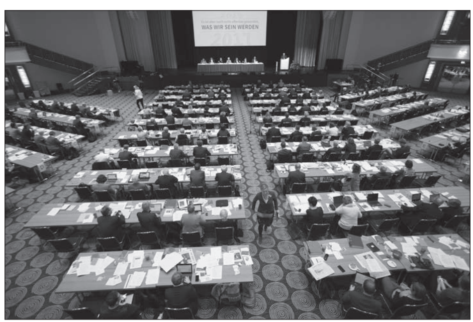
UN climate negotiations 2017.