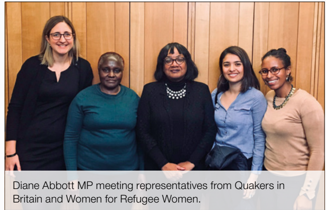
Diane Abbott MP meeting representatives from Quakers in Britain and Women for Refugee Women.

It's easy to appear to accidentally make assumptions about an MP's view, or to appear to be asserting your own view without considering their experience. A deliberately careful and measured tone can often work better.