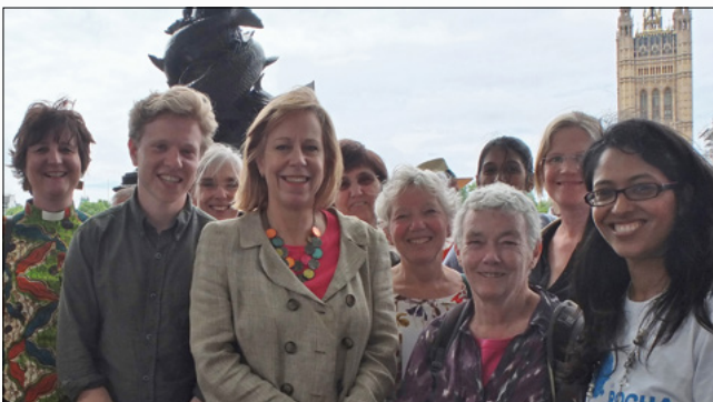
Ruth Cadbury MP meeting Quakers and others during a mass lobby about climate change.

At www.theyworkforyou.com you can find MPs' voting records and view their recent appearances in Parliament to see the issues they tend to speak about. Their website and Twitter feed will also give you clues about their views and interests.