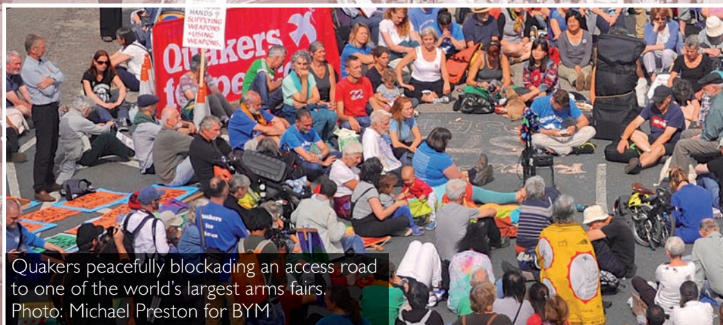
Quakers peacefully blocking an access road to one of the world's largest arms fairs.

Quakers share a way of life, not a set of beliefs. Their unity is based on shared understanding and a shared practice of silent worship, where they seek a communal stillness.