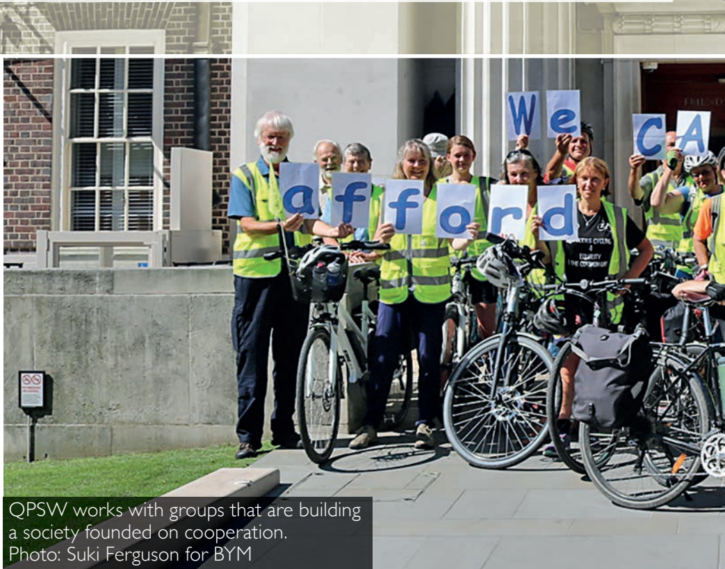
QPSW works with groups that are building a society founded on cooperation.

Donations enable us to go on supporting the Quaker community and working with and on behalf of all Quakers in Britain to make the world a more peaceful, just and sustainable place. All gifts and fundraising efforts help us turn faith into action. Find out how to give at www.quaker.org.uk/donate .