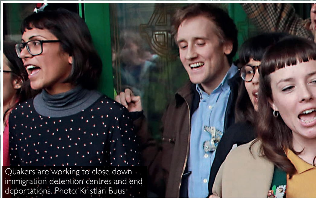
Quakers are working to close down immigration detention centres and end deportations.