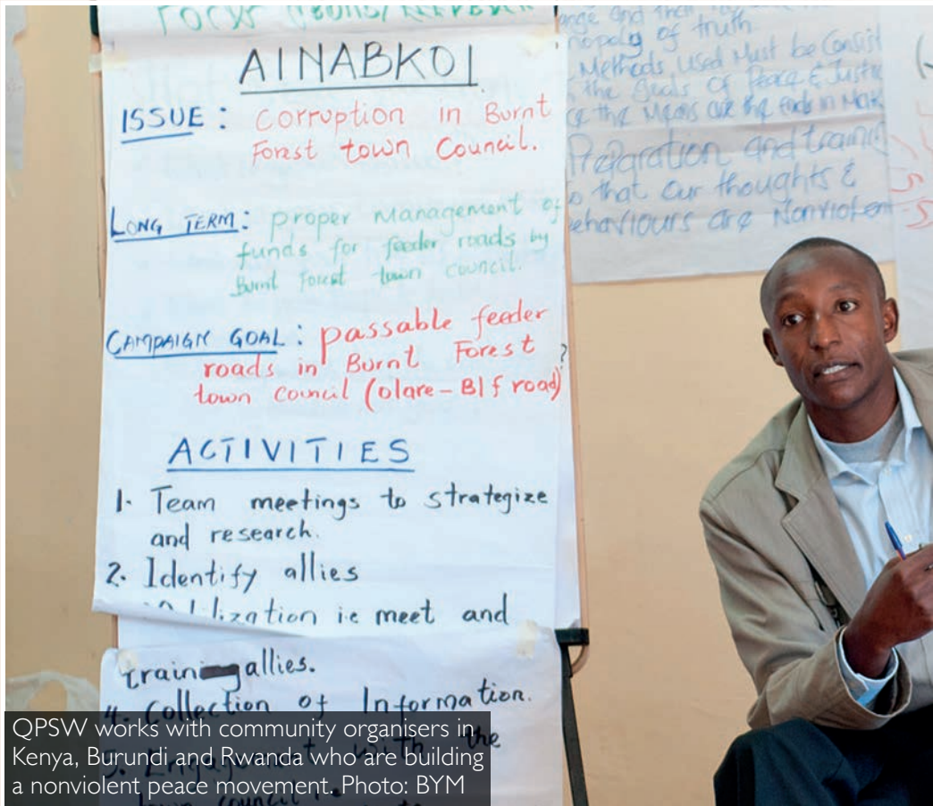
QPSW works with community organisers in Kenya, Burundi and Rwanda who are building a nonviolent peace movement.