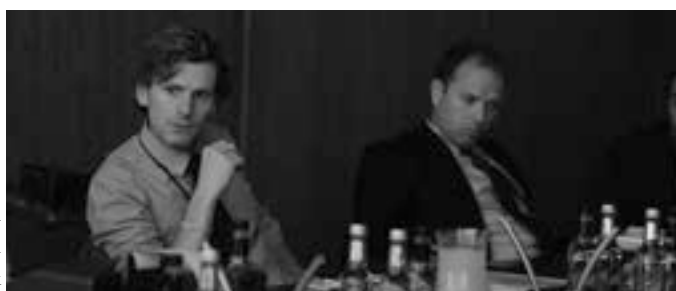
Still from Warbook