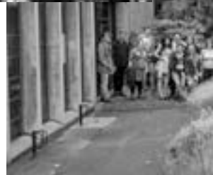
All of us who came to spend a night