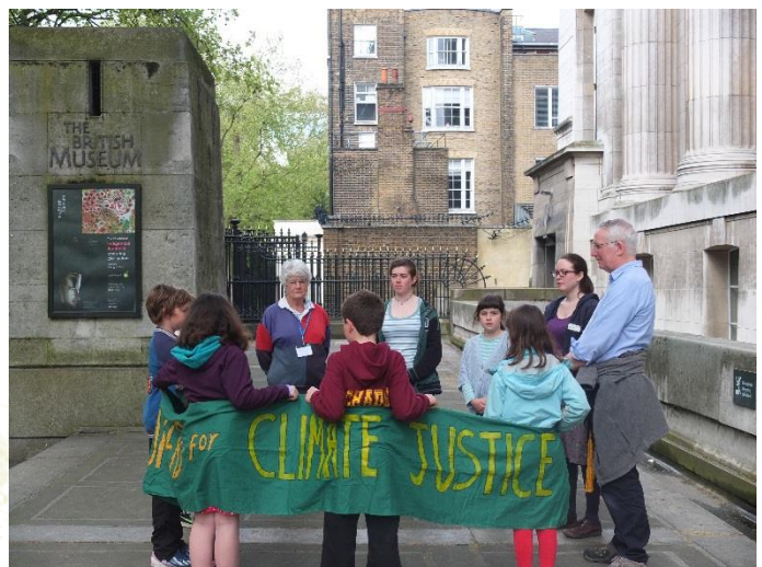
Young Quakers holding a meeting for worship for witness outside the British Museum, against sponsorship from BP.