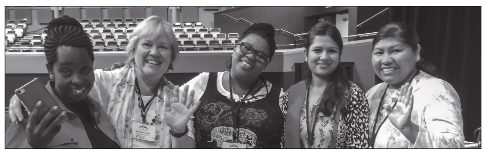
International visitors at Britain Yearly Meeting