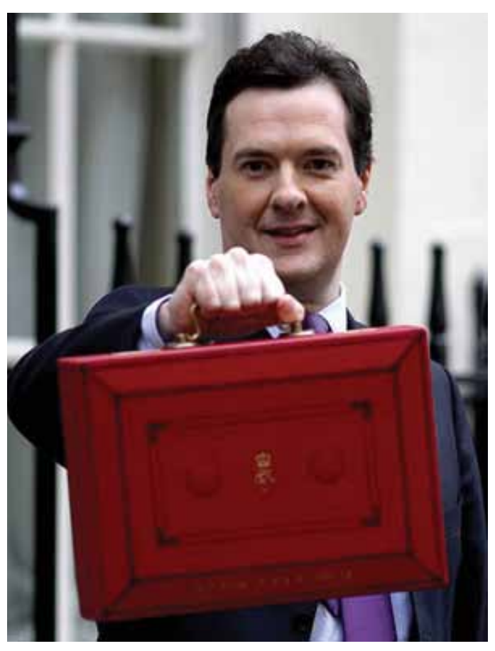
Chancellor George Osbourne

The budget commits £130 million to trains in the north of England and £15 million to Transport for London for investments in cycle safety. It maintains a rise in fuel duty (a tax paid levied on fuels used by most road vehicles). However, there was also confirmation of £56 million for a controversial Bexhill to Hastings link road.