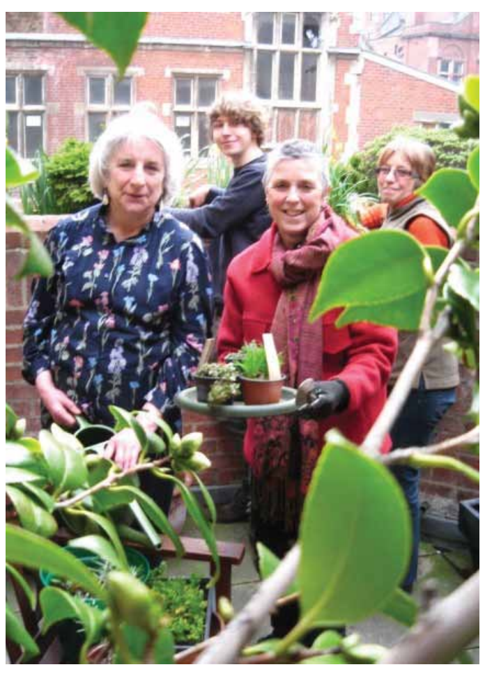
Friends at Sheffield Meeting.

Meeting for Sufferings has set up a 'Minute 36 Commitment Group' which is responsible,