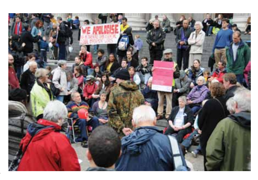
Meeting for worship at St Paul's Cathedral.

QPSW is also supporting Occupy Faith UK, an autonomous group which has emerged in