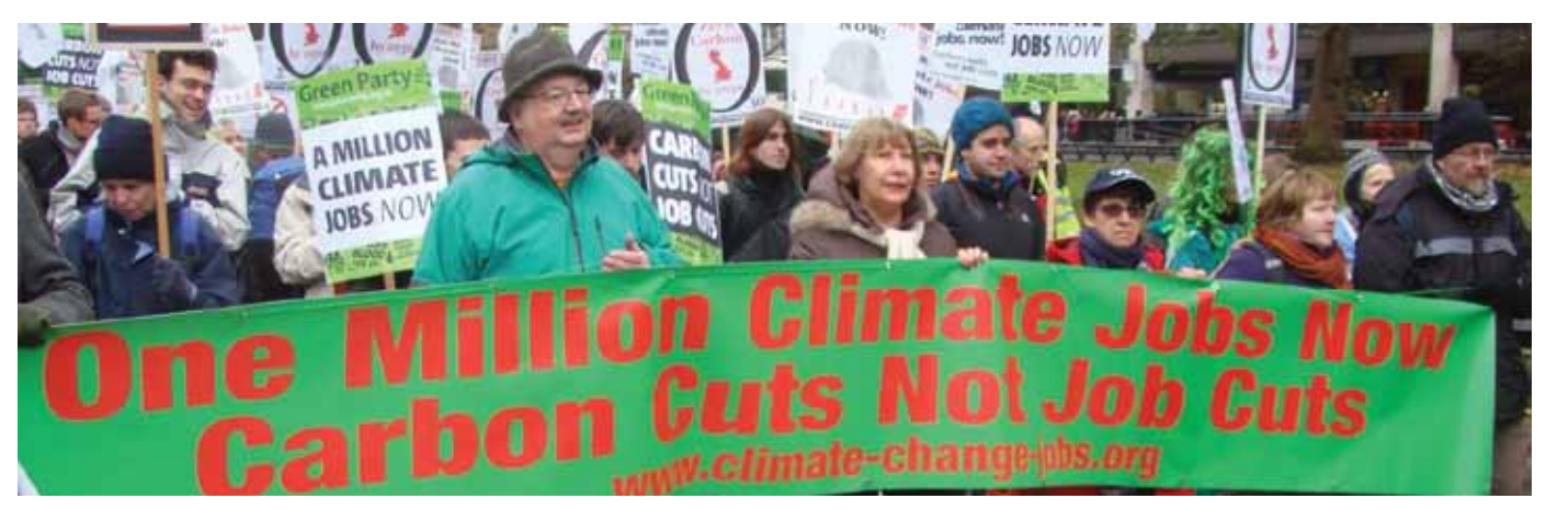
Campaign against Climate Change marching for climate jobs in 2010.

Friends call for government investment in jobs for a low-carbon economy.