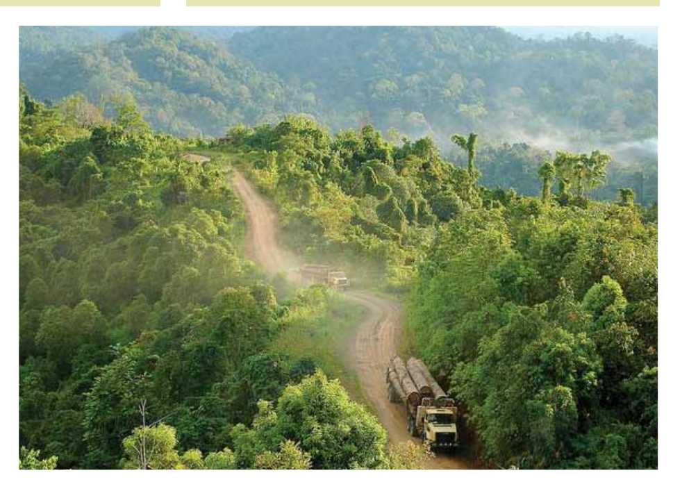
HPI measures how natural resource usage is converted in to happy living.

The Human Development Index (HDI) was developed by the United Nations Development Programme (UNDP) as a means of evaluating how well countries meet human needs. The index combines data on life expectancy, education and the material standard of living into a single statistic. It was designed to put people rather than financial indicators at the centre of policy making but does not consider environmental factors. Each year UNDP ranks over 180 countries according to HDI. In 2011 Norway, Australia and the Netherlands topped the list, whilst Burundi, Niger and the Democratic Republic of Congo received the lowest scores.